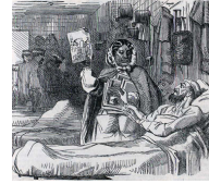
They both went out to the Crimea to help nurse soldiers.

Both women had to fight very hard to be able to do what they wanted to do: to be nurses and go to the Crimea.